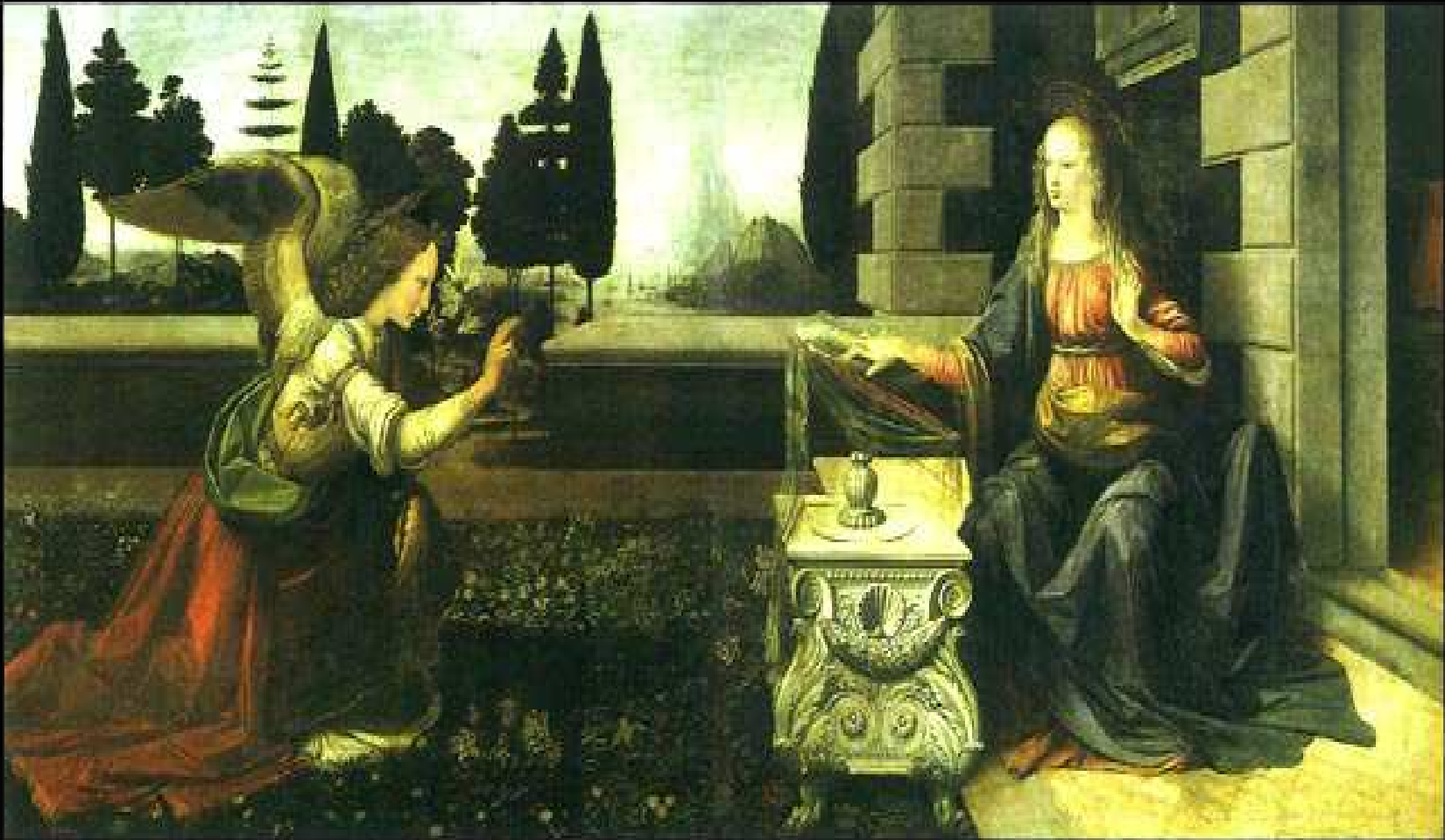
The Annunciation, Leonardo da Vinci