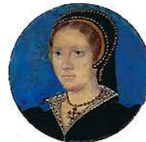
Katherine Parr (Horenbout)