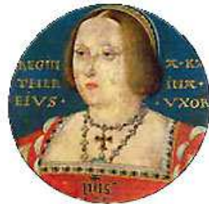
Catherine of Aragon (Horenbout)