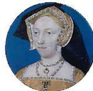
Jane Seymour (Horenbout)