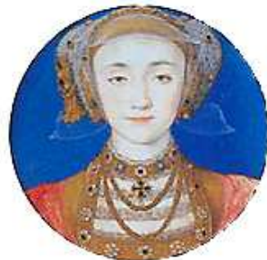
Anne of Cleves (Holbein)