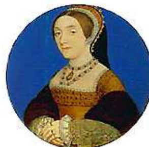
Katherine Howard (Holbein)