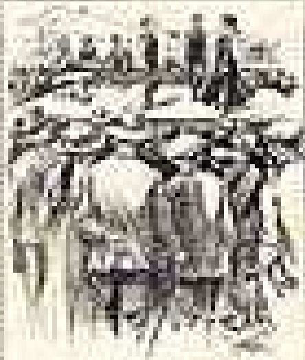
THE NEW YORK REVUE